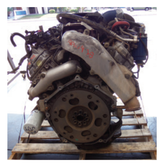
STEP 1 Unbolt the heat shroud from the stock down pipe.